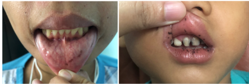
Figure 1 Black spots on the lips of the patient (left) and the patient's child (right).